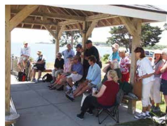
Top: Thursday Painting Group critique at Nonquit