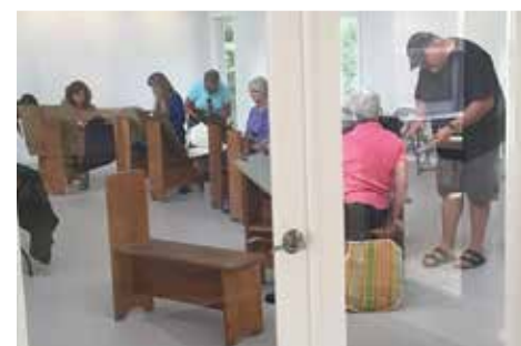
Left: First Drawing class (The Graphite Group) in the new studio