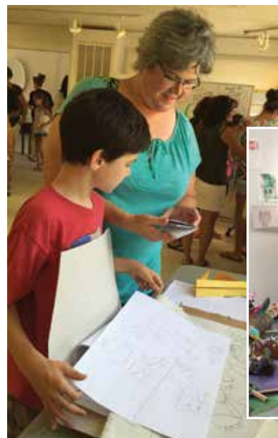
Summer Camp 2015

Send a check to P.O. Box 157, Westport Point, MA, 02791. Please make checks payable to Westport Art Group, Inc.