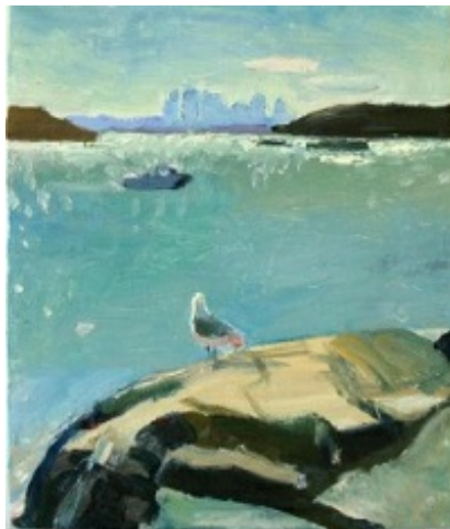
Looking Toward Boston, Brett Gamache

Experience the joy of painting on site with a small group of fellow artists in a two-day Plein Air Landscape Painting workshop on Saturday, September 9th from 9 am to 4 pm and Sunday, September 10th from 9 am to 4 pm in Westport.