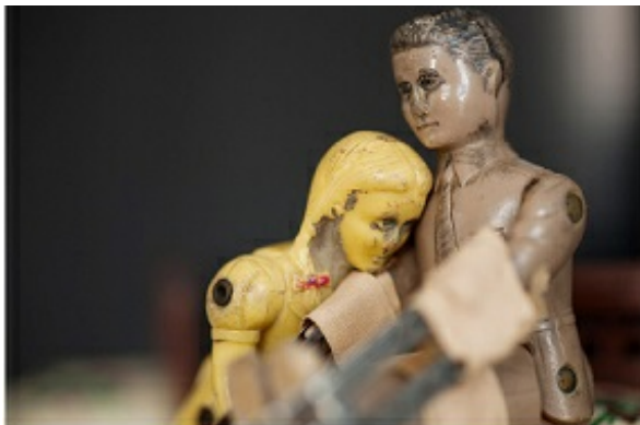
Close As Children from The McCann Family