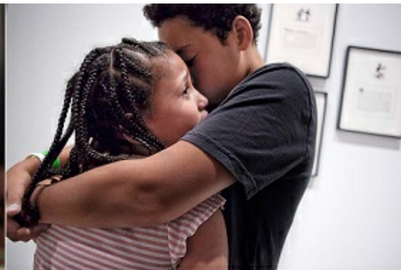
The Subject Was Slavery from Close to Home