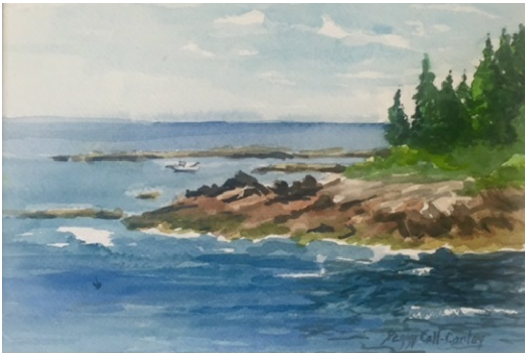
Watercolor by Peggy Call-Conley