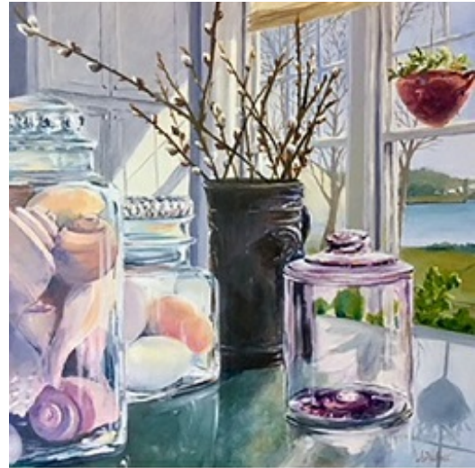
Spring Morning in my Kitchen, by Janet Dubuc

Gallery Attendants needed for the show! Please sign up with Sign-Up Genius to pick your time slot: https://www.signupgenius.com/go/20f0f4cada92da0fa7-63rd .